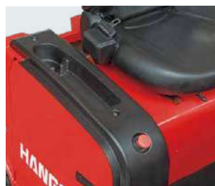
Cup holder, tool box