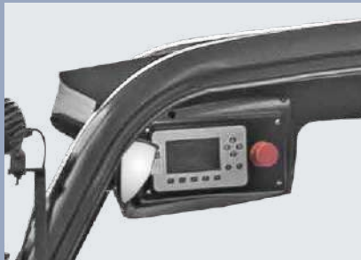
The dashboard in the driver's cab is placed overhead and can be seen when the driver lift her/his head, and the function buttons can be pressed easily