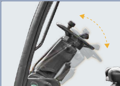
The ergonomically designed tilt-adjustable small-diameter steering wheel makes the driver feel good