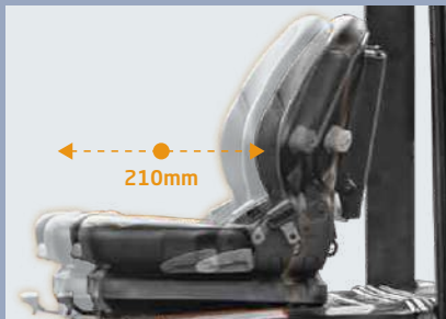
The seat can be adjusted back and forth by 210mm. The operator can choose the best driving position