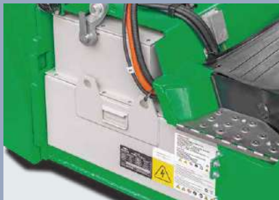
The packs can be easily removed by a manual or electric cart, and can be repaired and maintained conveniently