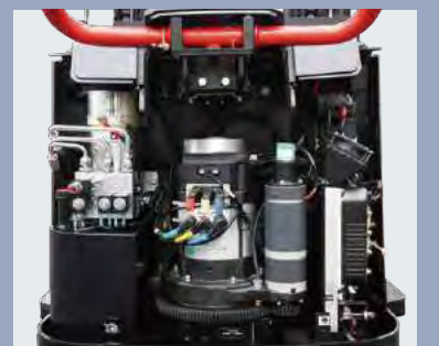
Back cover can be opened fully