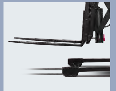
Proportional controlled forks can be operated more accurately