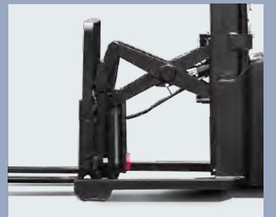
Forks move forward by the scissor structure